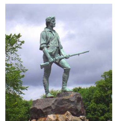
Statue of the Lexington Minuteman on the Lexington Green in Mass.