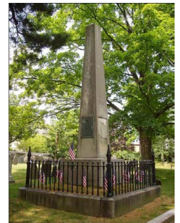
Patriots' Grave, Old Burying Ground, Arlington, Mass.