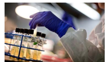
A microbiologist works with tubes of bacteria samples in a US antimicrobial resistance and characterization lab.

All that while other elements of the world’s culture (not just U.S. culture) have gone berserk. For instance, as with the tragic FB video above, as sadistic and Satanic as it was, yet