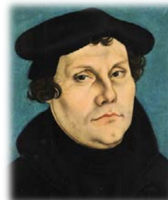
Martin Luther Portrait by Lucas Cranach, c. 1528