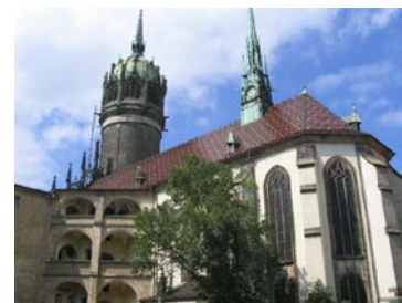
Luther's theses engraved into the door of All Saints' Church, Wittenberg, Germany