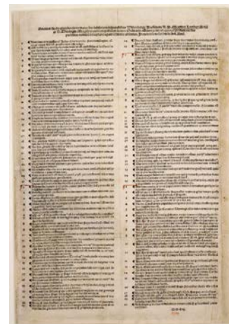
Copy 1517 Ninety-five Theses in the Berlin State Library