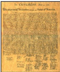
^ Click to see Larger ^ photo of original

That to secure these rights, Governments are instituted among Men, deriving their just powers from the consent of the governed , That whenever any Form of Government becomes destructive of these ends, it is the Right of the People to alter or to abolish it , and to institute new Government, laying its foundation on such principles and organizing its powers in such form, as to them shall seem most likely to effect their Safety and Happiness. Prudence, indeed, will dictate that Governments long established should not be changed for light and transient causes; and accordingly all experience hath shewn, that mankind are more disposed to suffer, while evils are sufferable, than to right themselves by abolishing the forms to which they are accustomed. But when a long train of abuses and usurpations, pursuing invariably the same Object evinces a design to reduce them under absolute Despotism , it is their right, it is their duty, to throw off such Government , and to provide new Guards for their future security.