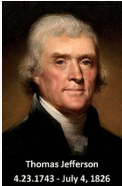
Thomas Jefferson 4.23.1743 - July 4, 1826