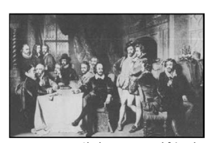
Shakespeare and friends