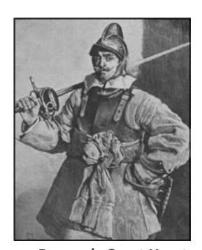
Bunyan's Great Heart

ALL FOR LOVE OR THE WORLD WELL LOST A TRAGEDY