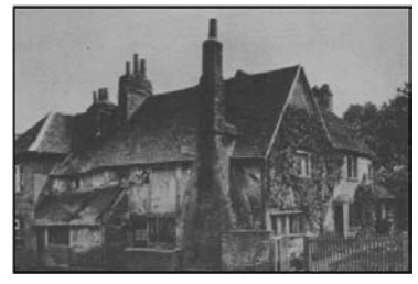
Milton's Cottage Chalfont St. Giles