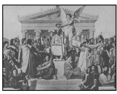
Apotheosis of Homer

29-PDF - 29-Kindle - 29-EPUB - 29-Read Online - 26.5M