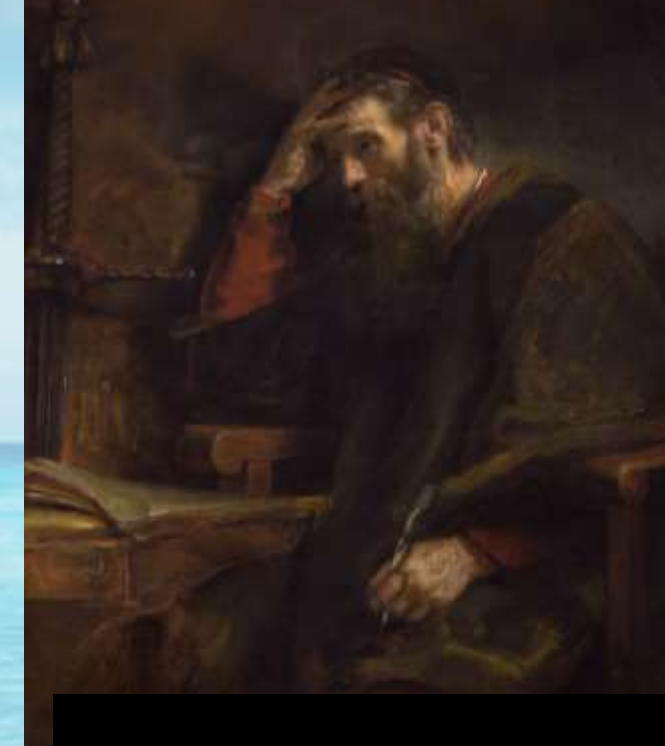
Apostle Paul, c. 1657 by Rembrandt van Rijn (1606-69)

9:6 Remember this: Whoever sows sparingly will also reap sparingly, and whoever sows generously will also reap generously.