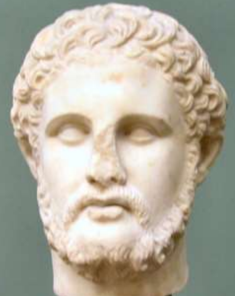
Philip II of Macedon 382–336 BC