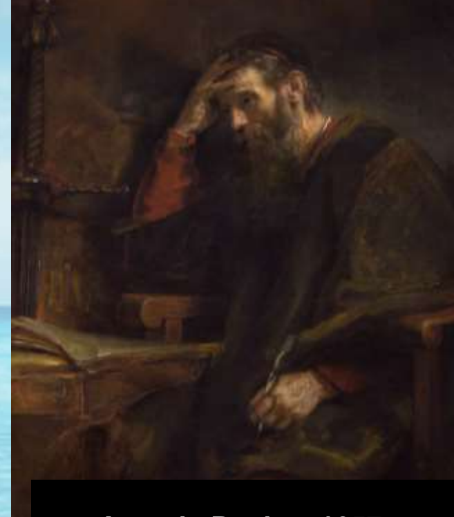
Apostle Paul, c. 1657 by Rembrandt van Rijn (1606-69)