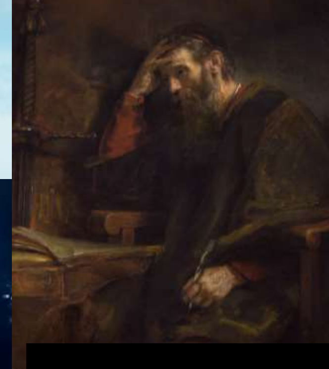
Apostle Paul, c. 1657 by Rembrandt van Rijn (1606-69)