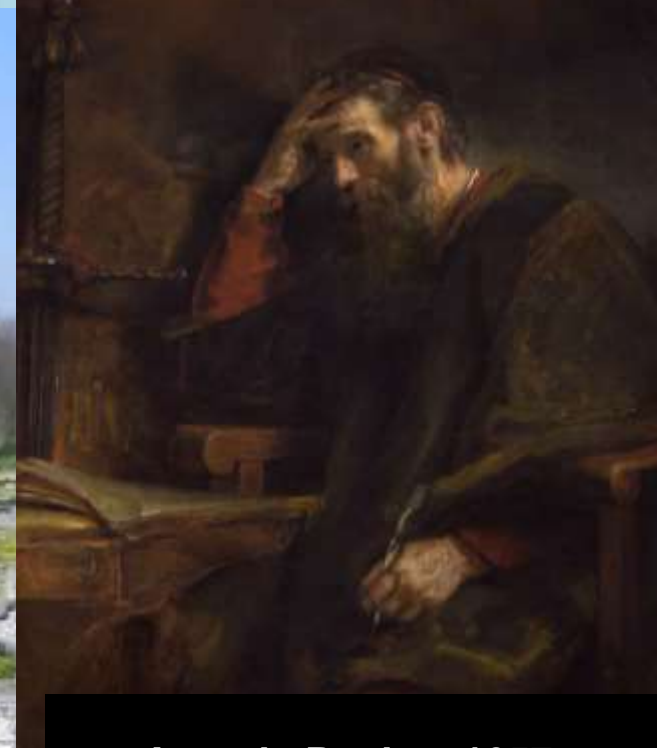
Apostle Paul, c. 1657 by Rembrandt van Rijn (1606-69)

Paul may have walked this very ROAD in c. A.D. 60