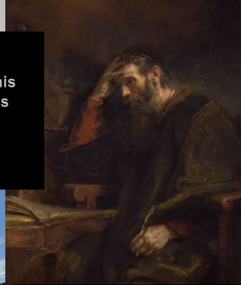
Apostle Paul, c. 1657 by Rembrandt van Rijn (1606-69)

Acts 16:34 – Jailer brought them into his house & set a meal before them; he was filled with joy because he had come to BELIEVE IN GOD — he & his whole household.