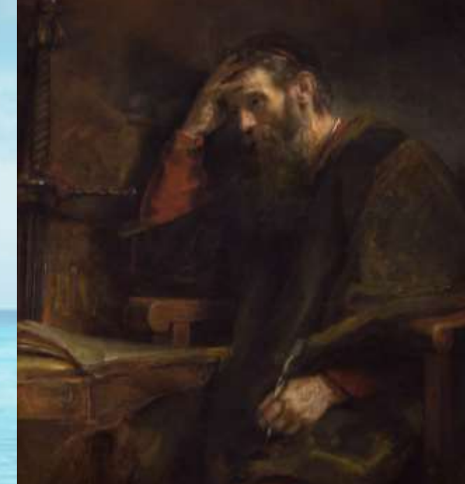
Apostle Paul, c. 1657 by Rembrandt van Rijn (1606-69)