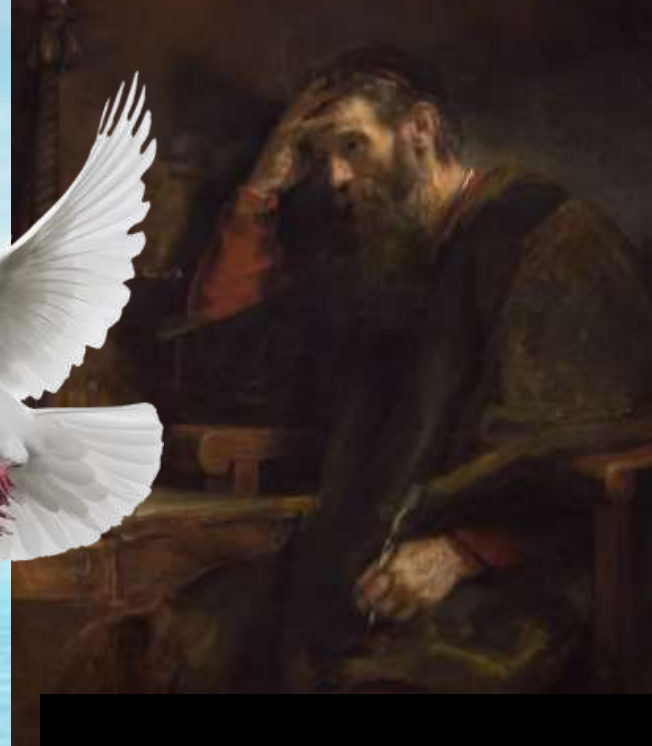
Apostle Paul, c. 1657 by Rembrandt van Rijn (1606-69)