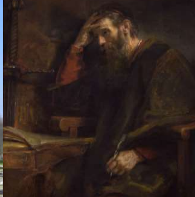
Apostle Paul, c. 1657 by Rembrandt van Rijn (1606-69)

Roman forum of Philippi, Macedon background are remains of a large Basilica, c. A.D. 550