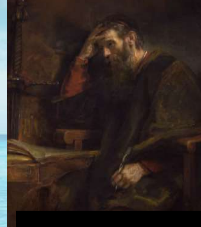
Apostle Paul, c. 1657 by Rembrandt van Rijn (1606-69)