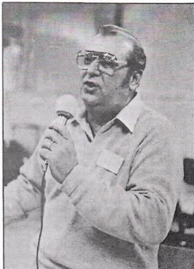
CARLIN - A GREAT WEEKEND