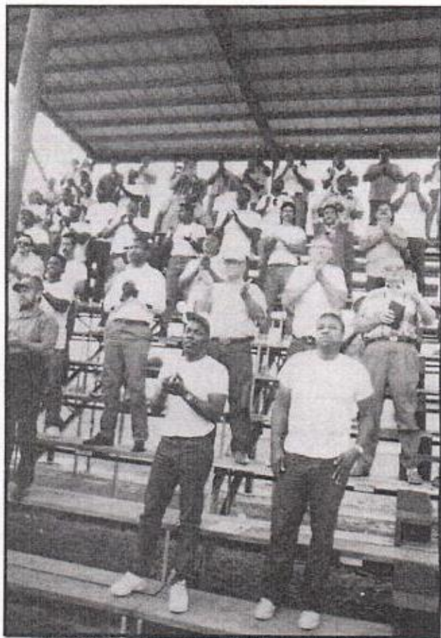
REVIVAL ON THE RODEO GROUNDS