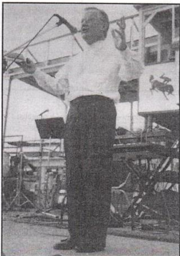
EVANGELIST FREDDIE GAGE