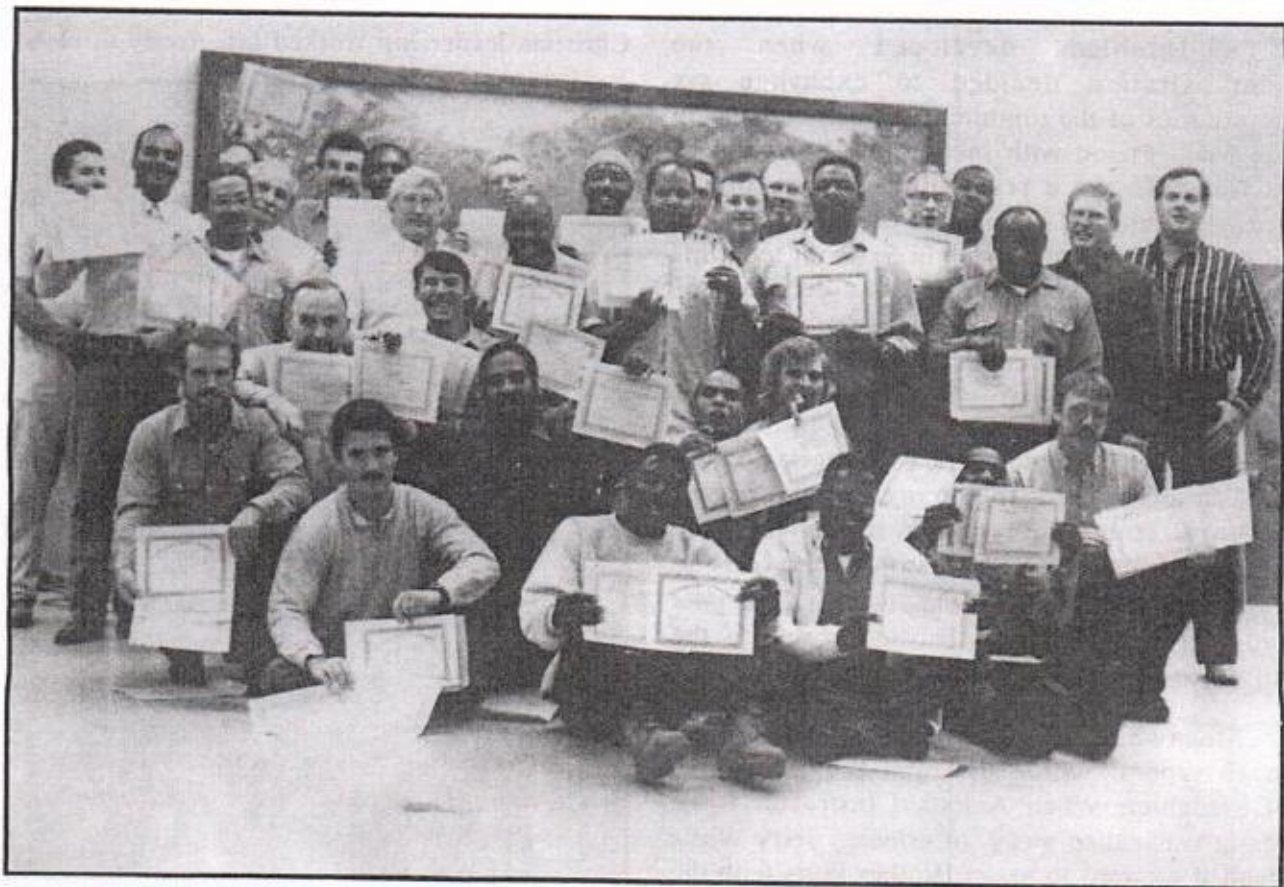
MASTERLIFE GRADUATING CLASS

*(The names marked by an asterisk completed Masterlife I but not Masterlife II, due to transfers. Four of the candidates not listed were transferred prior to completing any portion of the course.)