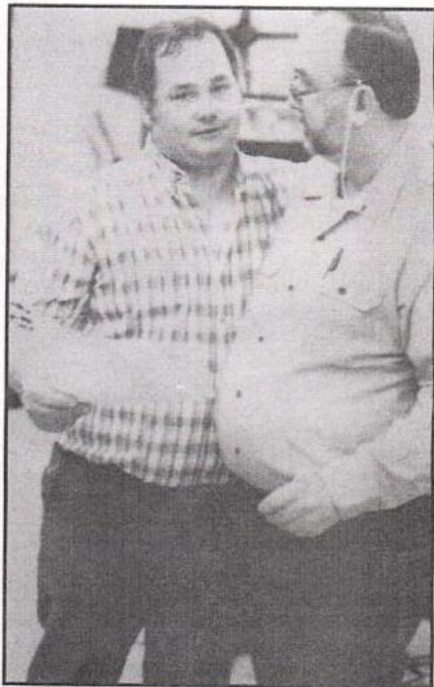
WHITE WITH DETERS

this strange mixture of individuals into one body in Christ. Separation became reconciliation. Some of the students made public apologies in class. The Holy Spirit was at work.