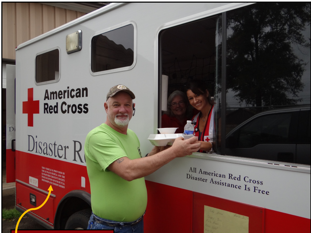
THIS VEHICLE IS PROVIDED BY THE KUWAITI PEOPLE AND THE KUWAITI RED CRESCENT SOCIETY IN RECOGNITION OF OUR MUTUAL FRIENDSHIP AND COMMON MISSION

In the end, the volunteers were keys to success, giving of their precious time and being available to help a neighbor and helping the full-time first responders get to the greatest needs more efficiently.