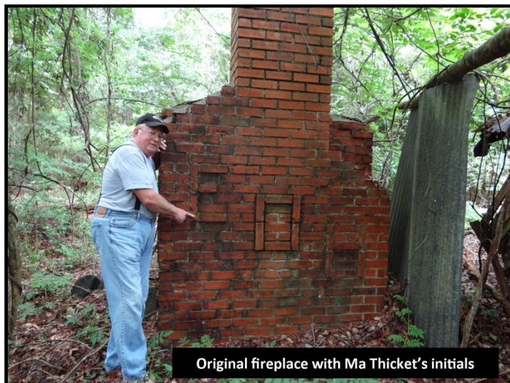
Original fireplace with Ma Thicket's initials