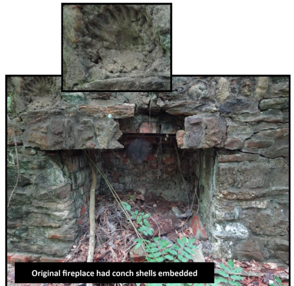
Original fireplace had conch shells embedded