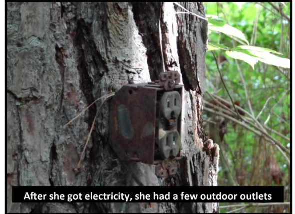
After she got electricity, she had a few outdoor outlets