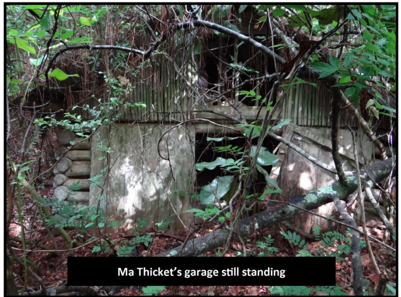
Ma Thicket's garage still standing