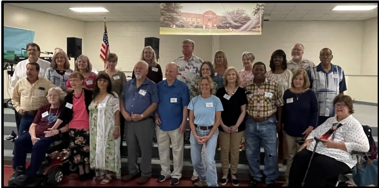
Kirby High School Honor Class of 1973

The Kirby High School Reunion at the WISD Elementary Cafeteria Saturday afternoon, May 6, celebrated the “Honor Class of 1973.”